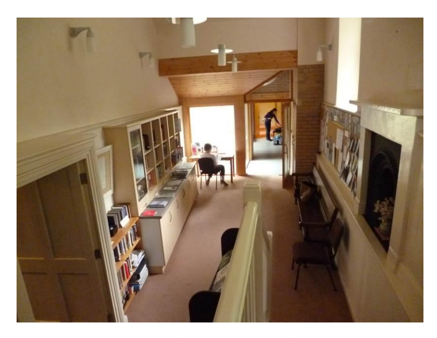
Fig.6: remodelled former institute, from the north