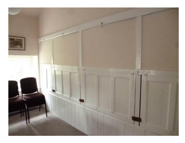
Fig.4: hinged shutters in gallery

The interior has one large meeting room that occupies all of the ground floor of the 1678 building, except for a passage across the north end, separated by a screen made of re-set oak wainscot panelling with a part-glazed door. The room has a plain panelled dado with grained finish, and plain plastered walls and flat ceiling. The deep gallery to the north is carried on a beam (reinforced in 2009 with steel) supported on cylindrical columns; the front of the gallery has hinged oak shutters with fielded panelling. The Elders' stand is to the south with late eighteenth century fielded panelling to the back and side walls (post-dating the blocking of the central window), a fixed bench and a nineteenth century panelled stand in front with moulded rail and turned finials. The floor is carpet on pine boards. The gallery is reached by a new staircase from the west wing and contains a nineteenth century chimneypiece. The floor of the west wing has been lowered to create a library and circulation area; the chimneypiece is retained but high on the west wall.