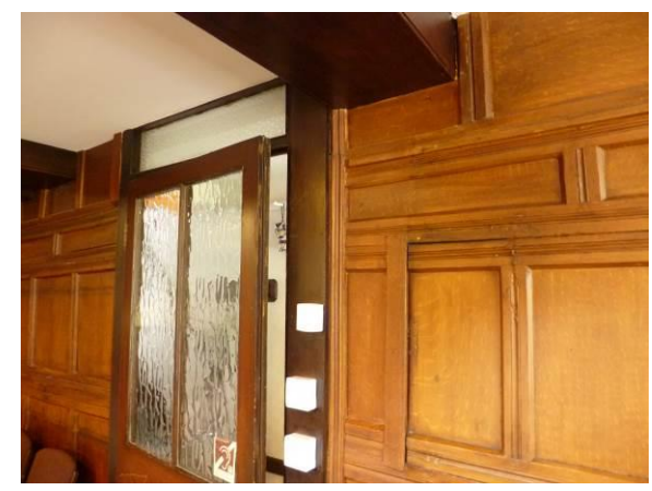
Fig.5: re-set wainscot in the entrance hall