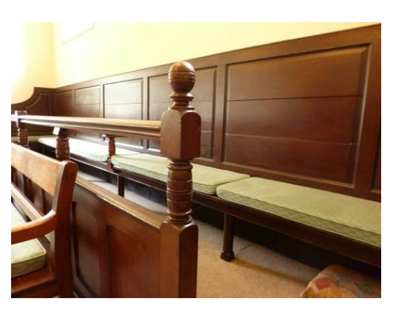
Statement of Significance

Settle meeting house has high significance as an early example of a Yorkshire Quaker meeting house built in the 1670s and extended and remodelled in the nineteenth century, and more recently. It retains some original fittings and has an attractive setting within a walled burial ground.