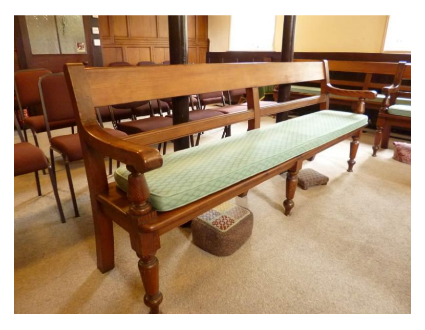
Fig.7: pine benches in the meeting room

The meeting room is furnished with a set of nine handsome pine benches with turned legs; these are probably Victorian. An oval table, probably of early nineteenth century date, is used in the centre of the room.