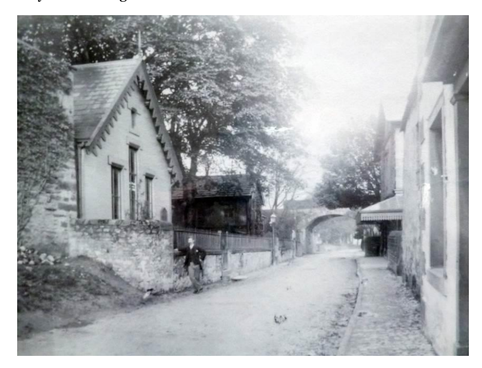
Fig 1: Kirkgate in c.1900 with 1872 Adult School to left and the meeting house beyond